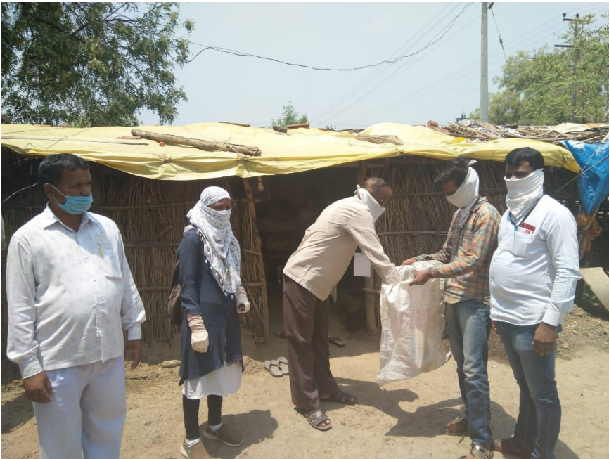
Local administration providing ration to those in need